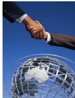
Good Business Practice

tem standards should not be confused with product or service standards. The use of product standards, quality management sys-